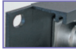
Perfil Panel muy robusto Strong panel frame