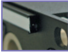
Perfil porta etiquetas Label frame