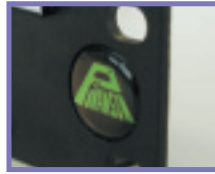
Logotipo incrustado Inserted logotip